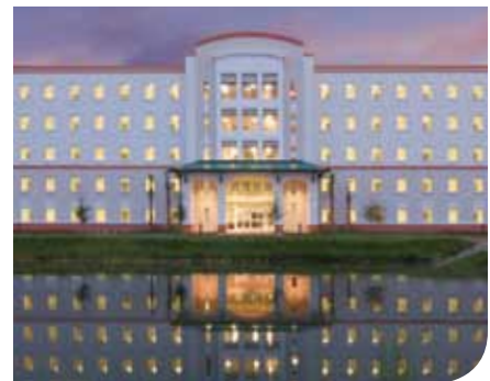
Florida Gulf Coast University

© Zehnder Rittling June 2011, English, subject to change without notice