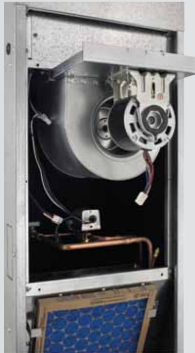
Removable blower assembly